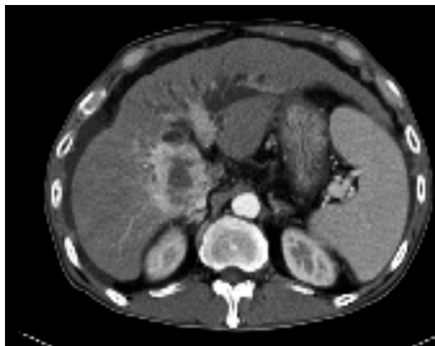
Figure 1. Abdominal computed tomography scan showing a 5.6 \times 5-cm-sized arterial and portal enhancing, delayed-washout mass with a central necrotic portion in segment 1. It is likely that intrahepatic bile duct dilatation and right portal vein and hilar invasion are also present. Underlying liver cirrhosis with splenomegaly and ascites is also present.

First, percutaneous transhepatic cholangiographic drainage was performed to lower the elevated bilirubin and to diminish the pruritus. The fistulography revealed hilar and proximal common hepatic duct obstruction with left intrahepatic duct dilatation (Fig. 2); this suggested