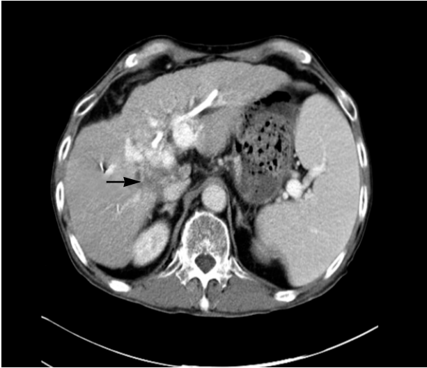
Figure 3. Abdominal computed tomography scan showing a slight decrease in the dimensions of the hypervascular mass involving the caudate lobe (4.8 × 3.2 cm).