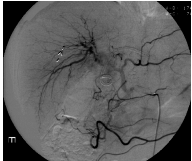
Figure 5. Angiography showing no definite hypervascular staining at the caudate lobe.