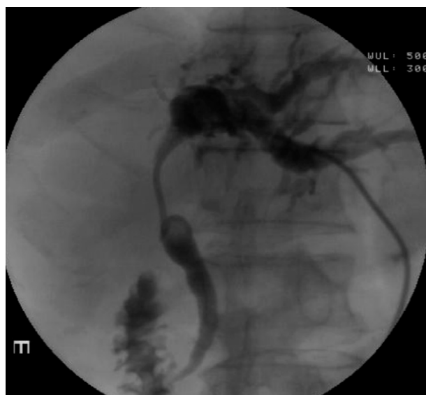
Figure 2. Percutaneous transhepatic biliary drainage showing hilar and proximal common hepatic duct obstruction with left intrahepatic duct dilatation. There is non-opacification of the right intrahepatic duct, suggesting right lobar hepatic malignancy with hilar invasion.

right lobar hepatic malignancy with hilar invasion. The level of total bilirubin was decreased from 57.66 mg/dL to 38.51 mg/dL after the procedure of external bile drainage. However, the bilirubin level was not decreased any more even though maintaining the draining catheter.