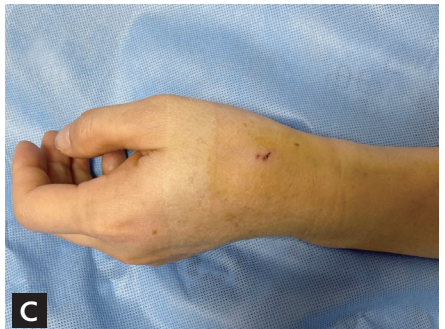
Figure 1. Inserted 6-French sheath via the left distal radial approach (A), hemostasis by compressive bandage method (B), and no access-site hematoma after 3-hour hemostasis (C).