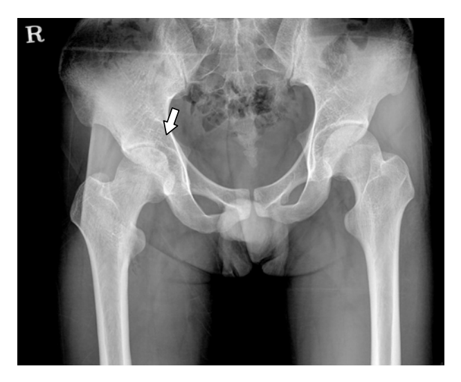
Figure 1. Pelvic radiography. Radiolucency superimposing the right femoral head can be observed.

our hospital for further evaluation of abnormal complete blood cell count which was performed at the dispensary. The patient suffered from weight loss, mild dyspnea, fatigue, intermittent fever, and night sweat. The further history was uneventful.