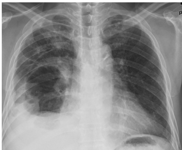
Figure 1. On the fifth day of hospitalization, chest radiography showed a newly developed air-cyst and air fluid level in the right lower lung.

was started with intravenous antibiotics (cefpiramide 1 g every 12 hours and amikacin 500 mg every 24 hours). Sono-guided thoracentesis was performed. The pleural fluid contained a pus-like material: WBC > 1,000/mm 3 almost PMNL; glucose 346 mg/dL; protein 4.3 mg/dL; LDH 2211 u/L. Bacteria, fungi and tuberculosis cultures were all negative, as were the blood and sputum cultures. On the fifth day of hospitalization, chest radiography revealed an air cyst and air fluid level in the right lower lung (Figure 1). On the ninth day, the size of the air-cyst had rapidly increased to about 9×11 cm in size; the air fluid level had also increased (Figure 2A).